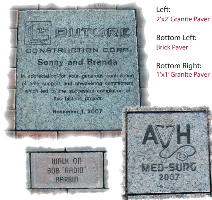
Left: 2'x2' Granite Paver

In addition to celebrating 50 years, the Auxiliary is looking ahead to 50 more years of service to the Hospital and community. The "Impressions of Care" Lighted Walkway Project marks the beginning of a new era.